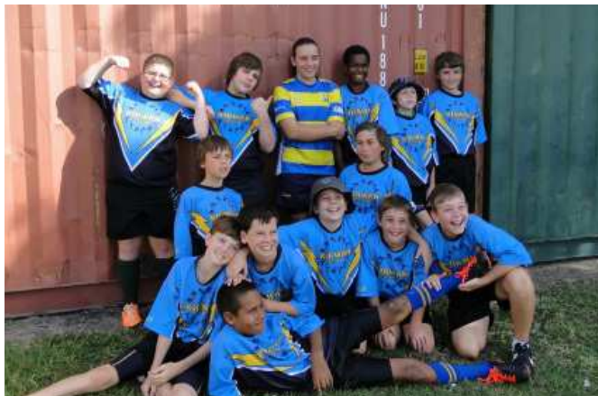
Kirwan Senior Rugby Team