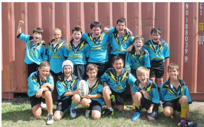
Kirwan Junior Rugby Team